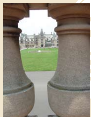
Biltmore. Asheville, NC

All information and stories in this publication may be reproduced.